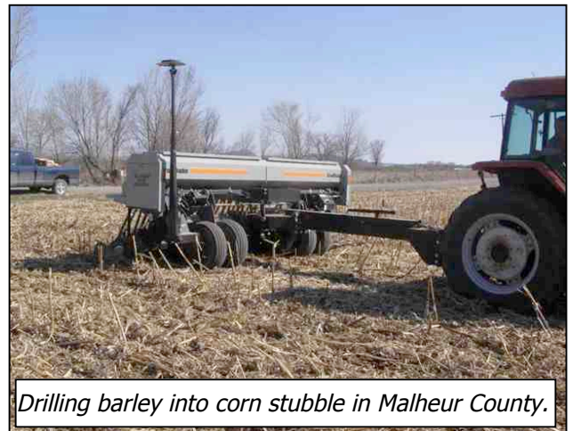
Drilling barley into corn stubble in Malheur County.

The Area Plan goal is to encourage voluntary compliance by agricultural producers with federal and state requirements to solve point and nonpoint source pollution through voluntary farm planning, technical assistance, financial assistance and educational programs to increase awareness.